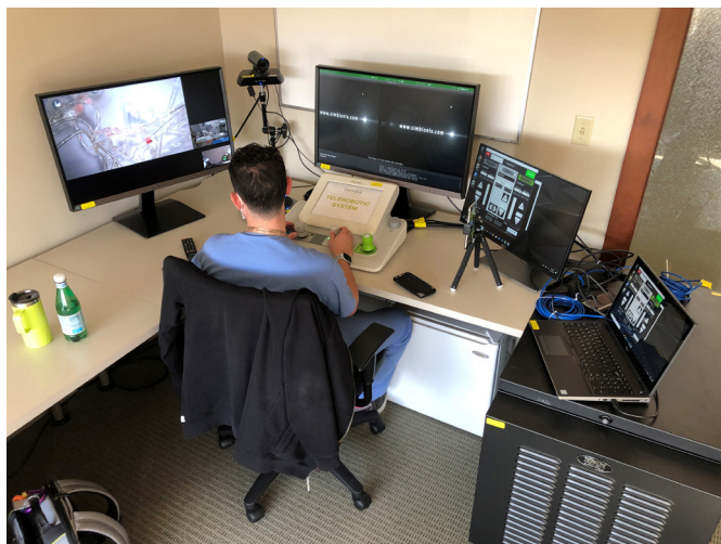
Figure 2 Offsite robotic control unit shown is the robotic control unit located in an office building approximately 5 miles away from the cardiovascular simulation laboratory. The monitor on the left displayed live video transmitted from the simulation laboratory and was intended to simulate fluoroscopy. In this image, the neurosurgeon is using the controls to telerobotically advance a wire from the carotid artery to the location of thrombus in the middle cerebral artery in the silicone model 5 miles away. MCA, middle cerebral artery; RRET, remote robotic endovascular thrombectomy

attempted procedures, the IC manually advanced an 8 Fr x 90 cm sheath (AXS Infinity LS, Stryker Neurovascular, Fremont, California, USA) from the right femoral artery to the left carotid artery and an 0.014 inch x 300 cm guidewire (Synchro 2 Support, Stryker Neurovascular, Fremont, California, USA) to the tip of the sheath. The IC loaded the guidewire into the robotic drive. All subsequent